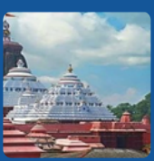
8. SHREE JAGANNATH TEMPLE