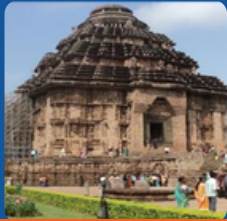
9. KONARK TEMPLE